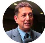
Bhanu Neupane ( https://globaldiamantooa.sched.com/speaker/bhanu_neupane.25xbzh26 ) Asesor de Comunicación e Información, Sección de Acceso Universal a la Información e Inclusión Digital Organización de las Naciones Unidas para la Educación, la Ciencia y...